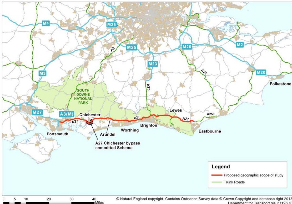
Figure 3-1: Geographic scope of A27 Corridor Feasibility Study

3.1.2 The A27 is the only east-west trunk road south of the M25. It links various cities and towns along the south coast, accommodating over three quarters of a million people, including Portsmouth, Havant, Chichester, Arundel, Worthing, Brighton and Hove, Lewes and Eastbourne. The A27 also provides access to Bognor Regis and the ports of Portsmouth, Shoreham and Newhaven, and provides businesses and residents in this corridor with access to the rest of the strategic road network.